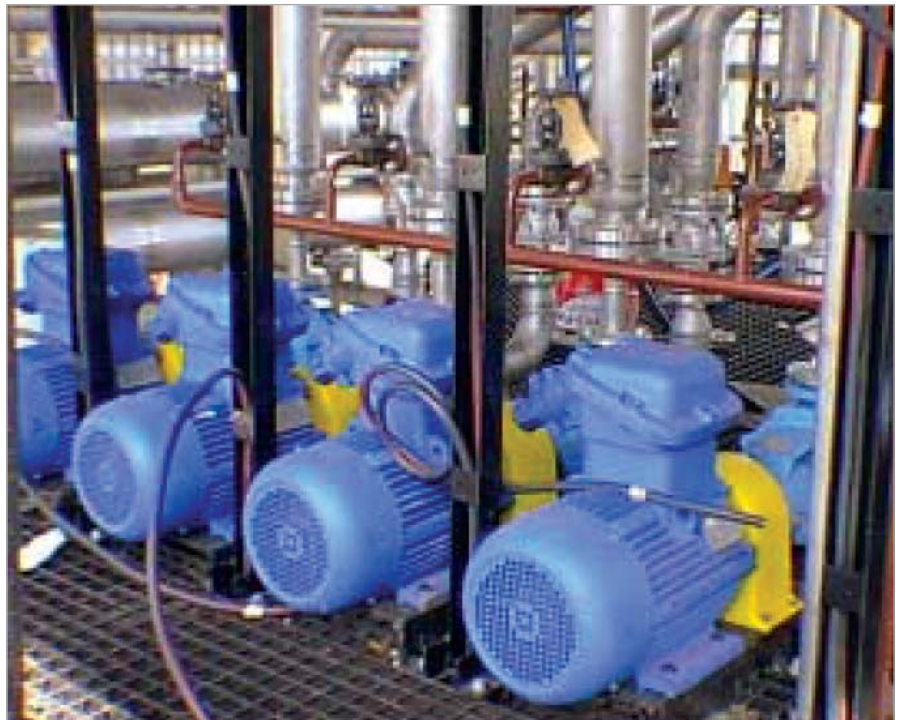
Fig. 1: Ex equipment must be suitable for the explosive environment.

For existing plant, this information is often not available. Existing area classification information is out of date and limited to drawings, often a plan